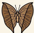
Dead Leaf Butterfly